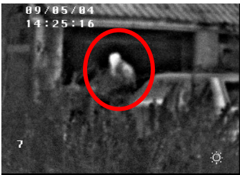
Before IR Garment