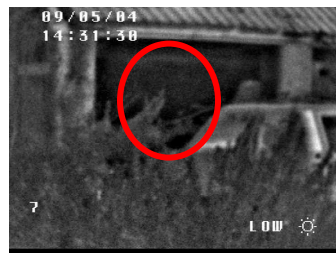
After IR Garment