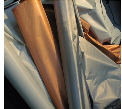
PRODUCT APPLICATION EXAMPLES